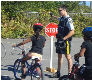
August 25 th – Successful Safety Day!

The Chief and Council are pleased to provide this update on the Esquimalt Nation Vision and Community Plan. This process will be an opportunity for the community to embrace our past, present and future in the context of change and planning for a better community.