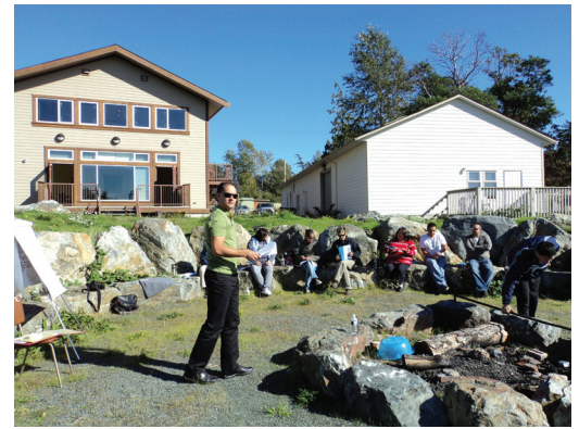
Suicide and Critical Response Team Workshop

Many aboriginal communities face challenges as they strive to prevent and respond to youth and adult suicide. This workshop was attended by 15 members of the Songhees and Esquimalt Nations, and government representatives. The workshop focused on preparing community-based response and assistance programs for individuals in crisis.