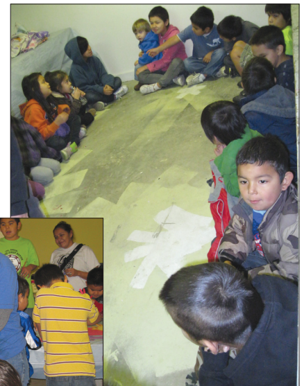
Christmas Break Youth Workshop participants (above & left).