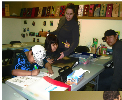
Homework Club participants (above).